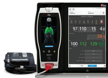
Root with Noninvasive Blood Pressure and Temperature